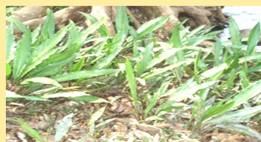
Plate 3. Lagenandra spp.

However, the fish production in the province is lower compared to the fish production in other provinces. There is a great potential in enhancing the production of fish and crustaceans in reservoirs as well as there is a potential for establishing ornamental fish and plant industry in Uva province. The aquatic resources in the Uva province indicate a potential for many research and also a possibility of initiating a cottage industry to improve the livelihoods of Uva community.