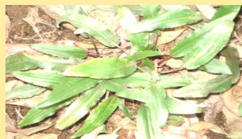
Plate 2. Cryptocoryne spp.

Lagenandra spp. (Plate 3), Ludwigia spp., Ceratopteris spp. and Cyperus spp. are commonly found in all streams in the Uva province. It is also believed that the ancient people have established Cyperus plants in streams so that the root system helps purify water.